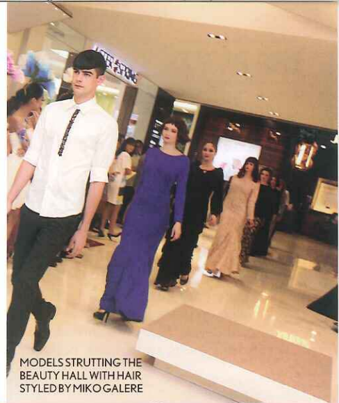
MODELS STRUTTING THE BEAUTY HALL WITH HAIR STYLED BY MIKO GALERE