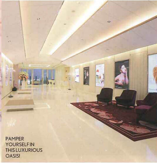
PAMPER YOURSELF IN THIS LUXURIOUS OASIS!